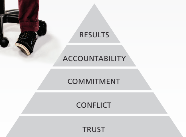
The Five Behaviors of a Cohesive Team Model